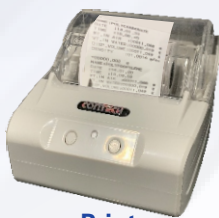
Printer Print out of density on the printer attached to the balance