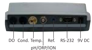
Ports for different electrodes on the rear panel